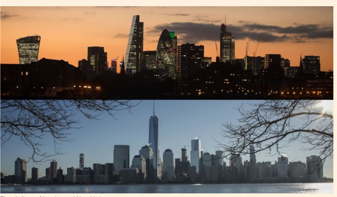
The skylines of London and New York

Forget the bright lights and fast pace of living in two of the world's greatest metropolises, city living for a new generation of financial workers is now more Jacksonville in Florida and Warsaw in Poland than New York and London.